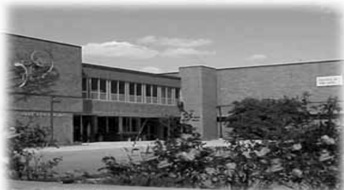
Center of the Arts